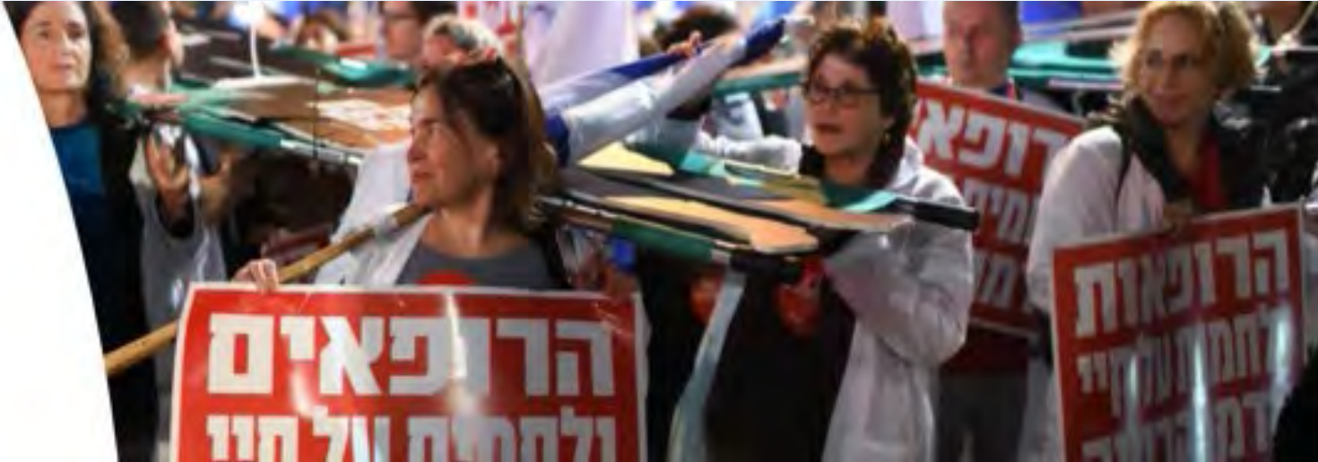
Doctors demonstrating in Israel.